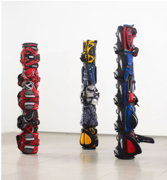
Brian Jungen, polyester, metal, painted wood on paper sonotube, 2007 (image courtesy Art Gallery of Ontario, © Brian Jungen 2017)