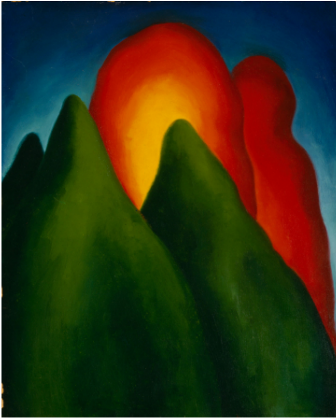
15 3/4 inches