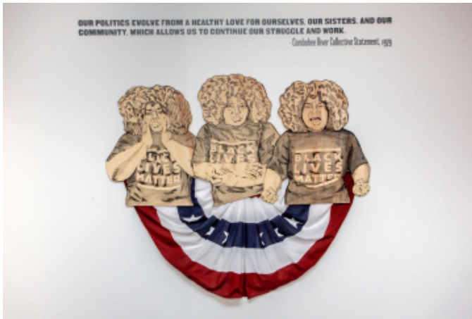
Chanel Thervil, “Pity Party: Selfies at the Start of the Trump Era,” (2017), acrylic on wood with pleated flag