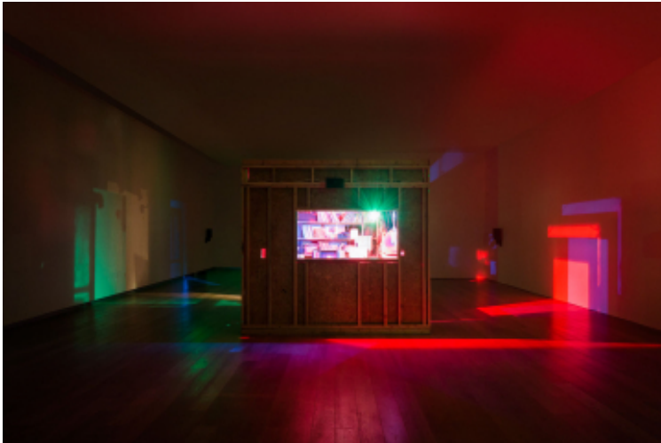
Opera for a Small Room