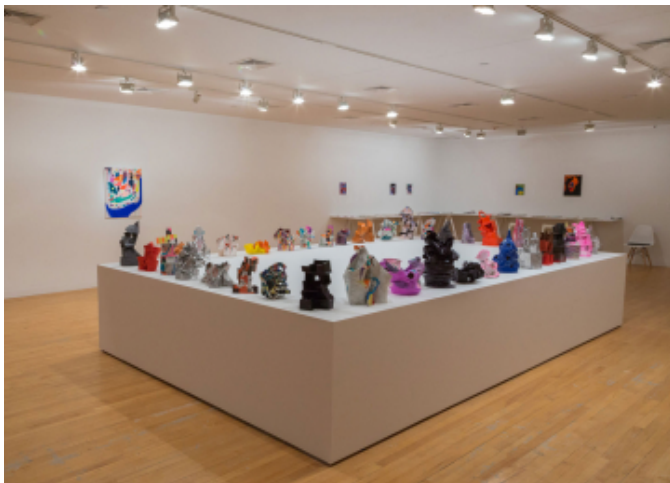
Partial view of Joanne Greenbaum: Things We Said Today installation