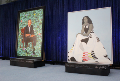
The official portraits by Kehinde Wiley (left) and Amy Sherald (right)

The unveiling and subsequent exhibition of President Barack Obama and First Lady Michelle Obama’s official portraits at the National Portrait Gallery might best be described as an ongoing cultural phenomenon, rather than an exhibition. Nine months later, there are still crowds arriving to see them, and the Portrait Gallery gift shop is so full of Obama-related merch that it’s easy to imagine, if only for a moment, that the portraits’ subjects still occupy the White House. With rare exception, outgoing presidents have selected traditional portraitists for the works that are commissioned by the National Portrait Gallery. President Obama’s selection of Kehinde