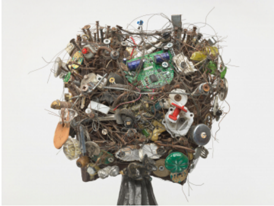
Jack Whitten, “Lucy” (2011), black mulberry, mixed media, Phaistos stone, mahogany, metal I-beam

Compared to his monumental, mosaic-inspired abstract paintings, Jack Whitten’s carved wooden assemblages are intimate, raw, and intuitive — but no less powerful. This ground-breaking exhibition, curated by Katy Siegel and Kelly Baum, presented decades of never-seen-before sculptural works created in his summer studio in Crete, full of totems, guardian figures, icons, and memorial reliquaries made from carved wood, marble, stone, acrylic, fish bones, plastic credit cards, photos, handwritten letters, and random scraps. Whitten’s sculptures are deliciously rebellious and fiercely lyrical, bursting with personal narrative, as well as African, Classical, and literary allusions, though their impact upon