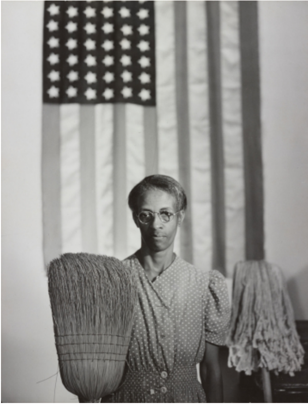
Gordon Parks, Washington, D.C. Government chairwoman, July 1942. Gelatin silver print mounted to board with typewritten caption sheet