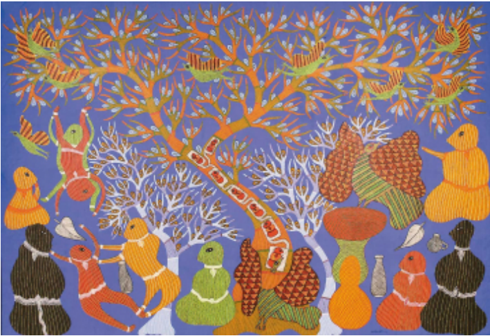
Ram Sign Urveti, “Woodpecker and the Ironsmith” (2011), acrylic on canvas