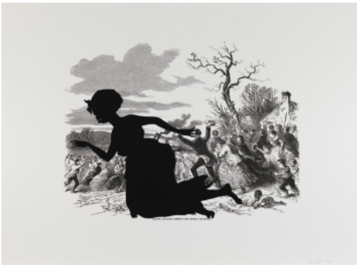
Kara Walker, “Alabama Loyalists Greeting the Federal Gun-Boats,” (2005) from the portfolio Harper’s Pictorial History of the Civil War (Annotated) , offset lithograph and