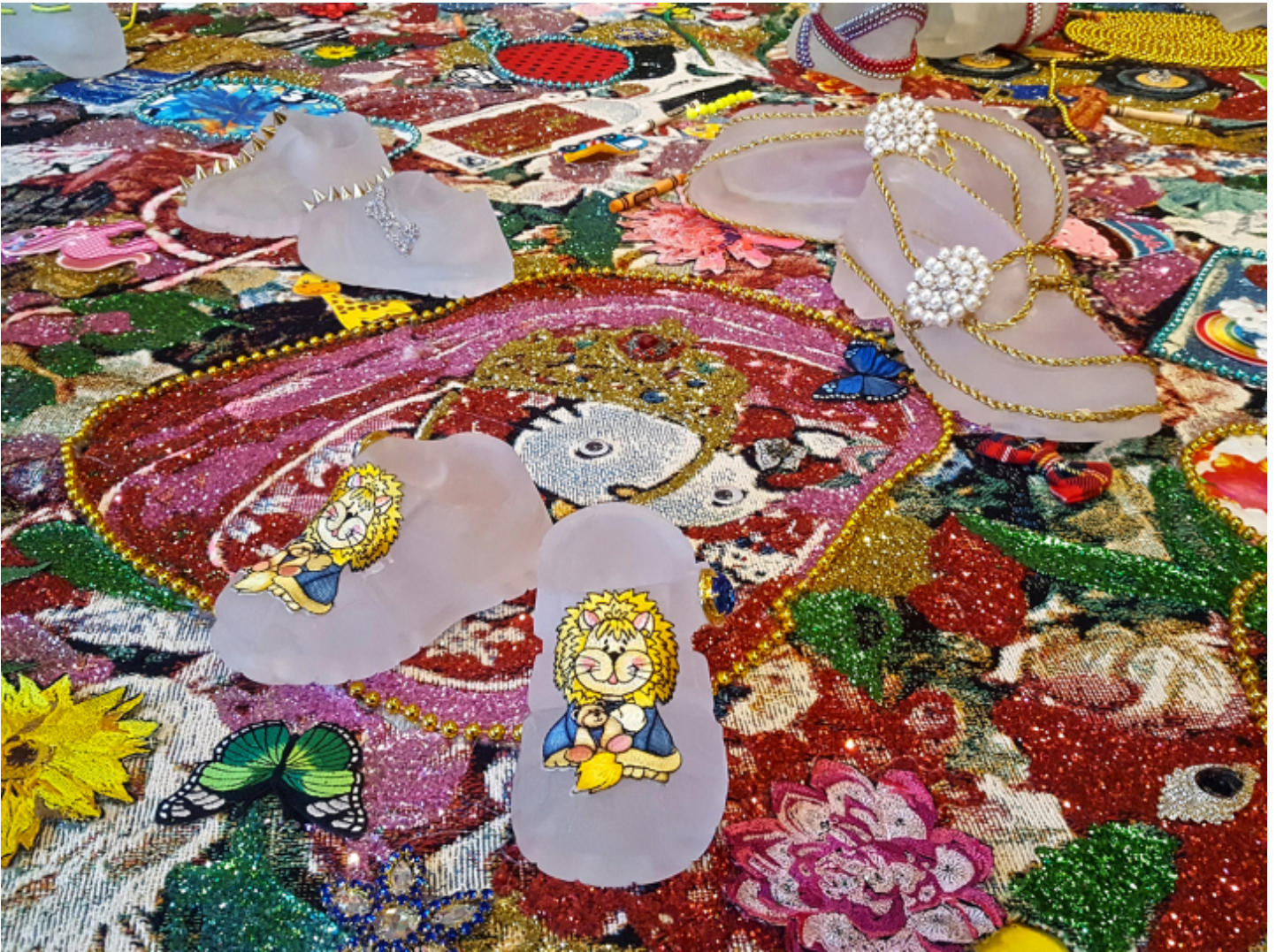
Of 72 by Ebony Patterson (detail view)

Art visualizing identity and community took center stage in our top 20 exhibitions across the United States for 2018.