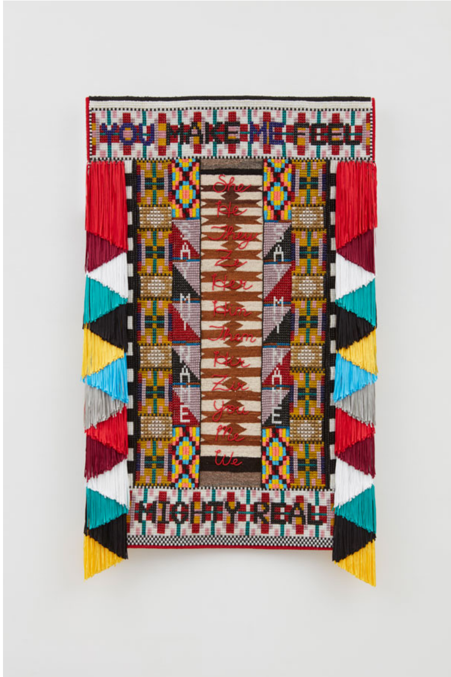
Jeffrey Gibson, SAY MY NAME , 2018. Glass beads, copper and tin jingles, steel and brass studs, and artificial sinew on repurposed trading post weaving and acrylic felt, mounted on canvas, 69 × 41.5 × 3 inches. © Jeffrey Gibson. Courtesy the artist; Sikkema Jenkins & Co., New York; Kavi Gupta, Chicago; and Roberts Projects, Los Angeles.

acculturation, as a way to prove that you were not from the reservation, as a way to show that you were equal to other people, especially “white” people. Now it’s like a reverse privilege to embrace the landscape, and even indulge in it by appointing the land the power of redemption.