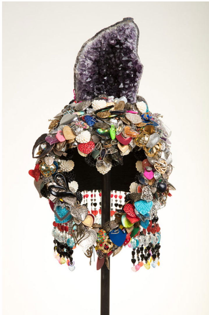
Jeffrey Gibson. Love, 2018. Epoxy clay with glass beads, metal, resin, and plastic heart charms, amethyst geode, steel wire, nylon thread, and pigmented acrylic gel medium, 25 \frac{1}{2} x 14 x 15 \frac{3}{4} in. Courtesy the artist; Roberts Projects, Los Angeles; Sikkema Jenkins & Co., New York; and Kavi Gupta, Chicago.

Rail: Right, it feels that regardless of what kind of outsider culture, there's the dichotomy of wanting to assimilate, to be accepted, but at the same time wanting to express a sense individuality from it. For the performance Like A Hammer (2016), you wore one of these garments. Can you talk about that performance?