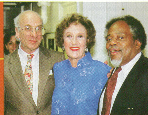
Jazz pianists Dick Hyman H'02, Marian McPartland H'97 and Roland Hanna.

Jazz came of age and reached maturity in the more than three decades that encompassed World War II, Korea and Vietnam. The Hamilton College Jazz Archive is rich with war stories, from harrowing tales of combat to barracks humor, from racism in the ranks to struggles with the ethics of killing and the rigors of life stateside. Part of the archive's future mission will be to establish the value of such oral histories outside the realm of music scholarship. They are the narratives of lives fully lived, in uniform as well as on the bandstand.